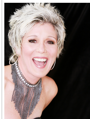
Sylvia McNair.